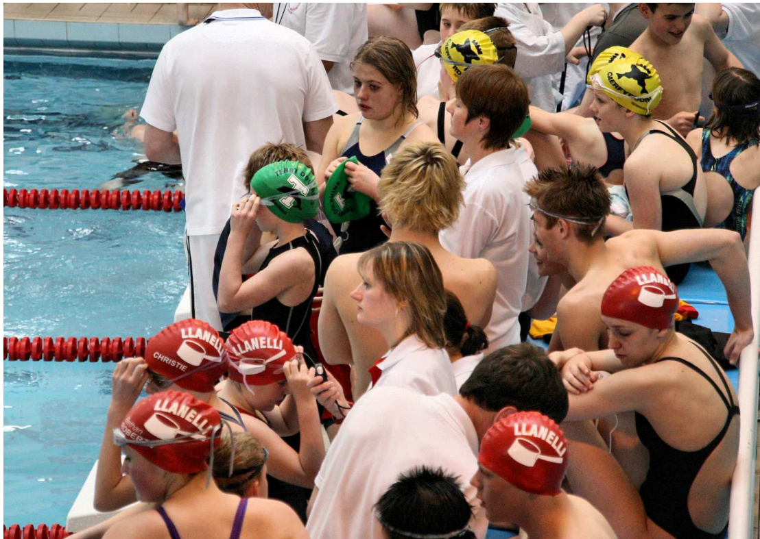
Swimmers from Carmarthen, Tenby and Llanelli wait in the packed starting area before a race at the 2007 Dyfed Senior League Final.

On Saturday 31 st March, the Dyfed Senior League final was held in Llanelli. The Tenby swimmers were up against some tough competition from the teams from Llanelli and Carmarthen. In the preliminary rounds of the competition Tenby performed very well and came out on top on both occasions. However, in this instance we were without several of the older team members, and on the day not quite able to produce the form shown earlier. Eventually we were squeezed down into third place by our main rivals. Nevertheless, there were some encouraging swims from some of the younger members of the team which bodes well for the future.