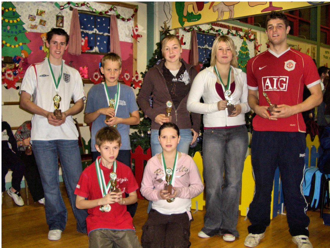
11, 12-13 and 14/O Age Group Trophy Winners at this years Tenby Dolphins Club Championships.

Over the weekend of the 15 th to 17 th December the Swim Wales Winter Long Course Open Meet was held at the National Pool in Swansea. A small group of our swimmers made the trip and represented Tenby/Pembrokeshire Aces in the competition. This was a competition with Age Group 200m races and Open events for the top competitors.