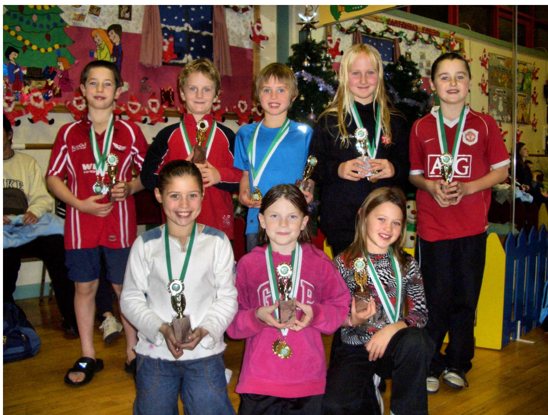
7, 8 , 9 and 10 Years Age Group Trophy Winners at this years Tenby Dolphins Club Championships.

A full list of results is available on the Tenby Dolphins web site, together with a great collection of photos of the various medallists from the club championship.